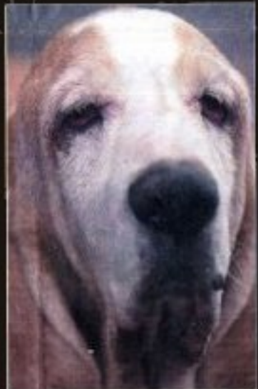
ELBORN END: The two basset hounds who were controversially shot